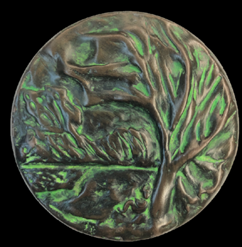
"Pastorale" (Exhibited virtually at National Academy of Art in Sofia, Bulgaria) 2022