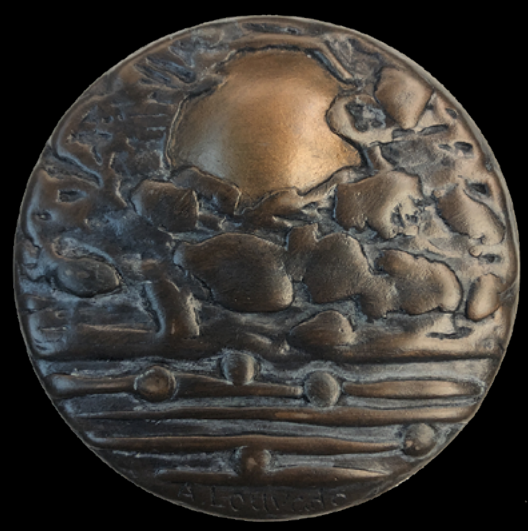
"Noctturno" (Exhibited virtually at National Academy of Art in Sofia, Bulgaria) 2021