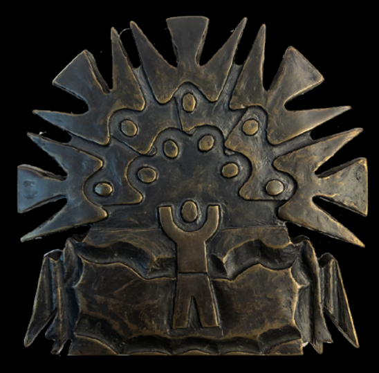
"Calling all Angels" (Exhibited on FIDEM XXXI Finland) 2010