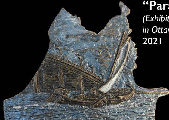
"Paradise" (Exhibited at RCNA Convention in Ottawa, Canada) 2021