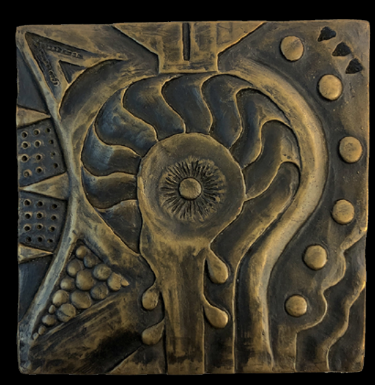
"Ancient Memories" (First prize Student medal competition, by MASC) 2008