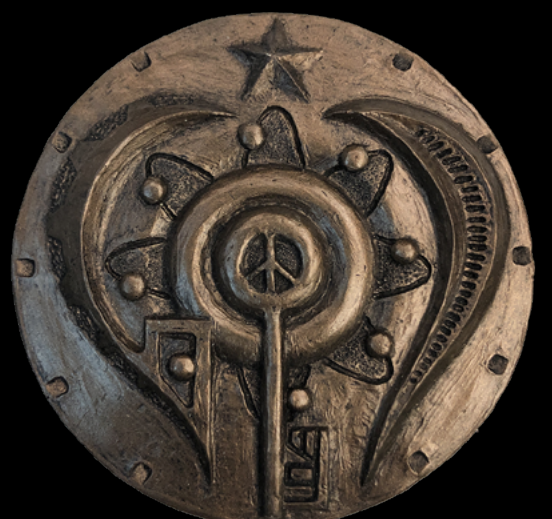
"The Key" 2009