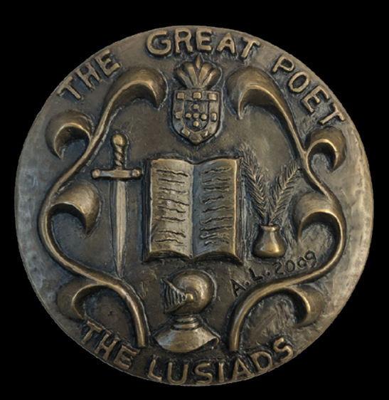
"The Great Poet" 2009