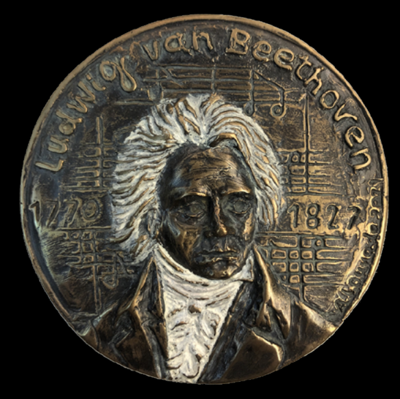
"Beethoven" (Exhibited virtually at National Academy of Art in Sofia, Bulgaria) 2021