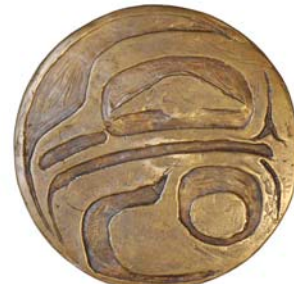
Paul Bentzen The Eagle (Reverse)