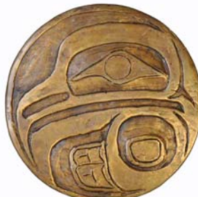
Paul Bentzen The Eagle (Obverse)