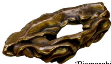
"Biomorphic Wedding Ring" 4"x2.5"x.5"