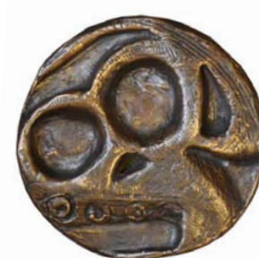
Soojin Chung Morning Rise (Reverse)