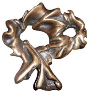
"Ribbon Ookpik" 3"x3"x.75"