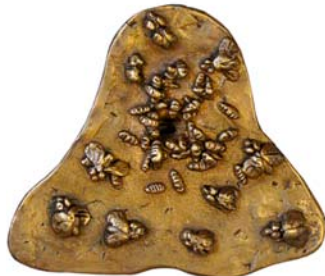
Shirin Diranbeigui Freedom (Reverse)