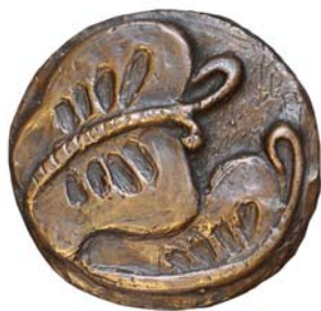
Yu Pan Wang Butterfly (Obverse)