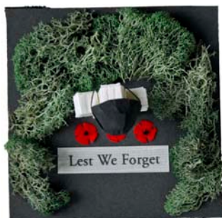
Jeff Close Less we Forget