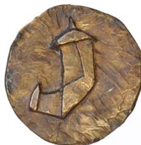
Cassandra Cabral-Berbatiotis Om Nom (Obverse)