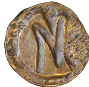
Natasha Dover The Eye Dreams (Reverse)