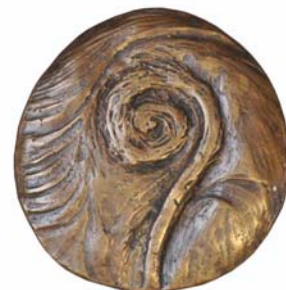
Doris Purchase Otis (Reverse)