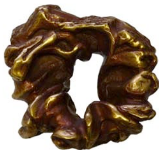
"Femme Liquide" 3"x3" x1"