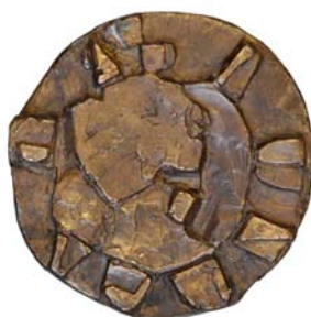
Cassandra Cabral-Berbatiotis Om Nom (Reverse)