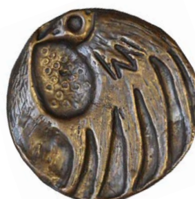
Soojin Chung Morning Rise (Obverse)