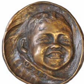
Doris Purchase Otis (Obverse)