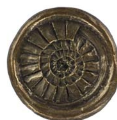
Emmeli-Sue Klumpenhower It Looks Scary ...