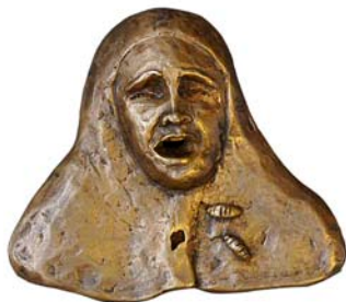
Shirin Diranbeigui Freedom (Obverse)