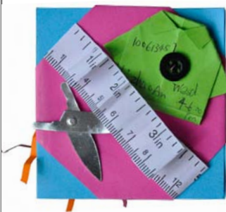
Li Zhoa An Sewing Kit

For further information about the courses, please contact: Lorraine Wright lwright@georgebrown.ca