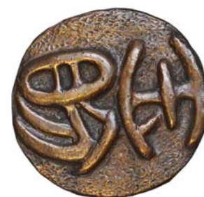
Yu Pan Wang Butterfly (Reverse)