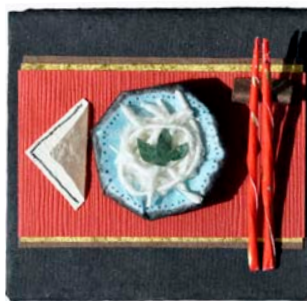
Rhys Davis Noodles