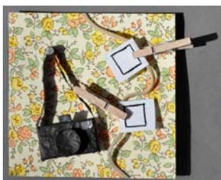
Linzie Hunt Picture This