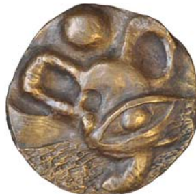
Natasha Dover The Eye Dreams (Obverse)