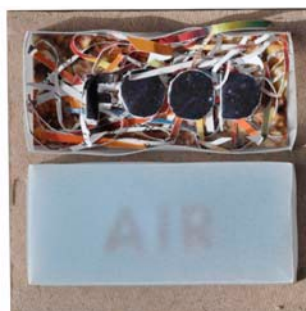
Wayland Gill Food, Air, Art, Design